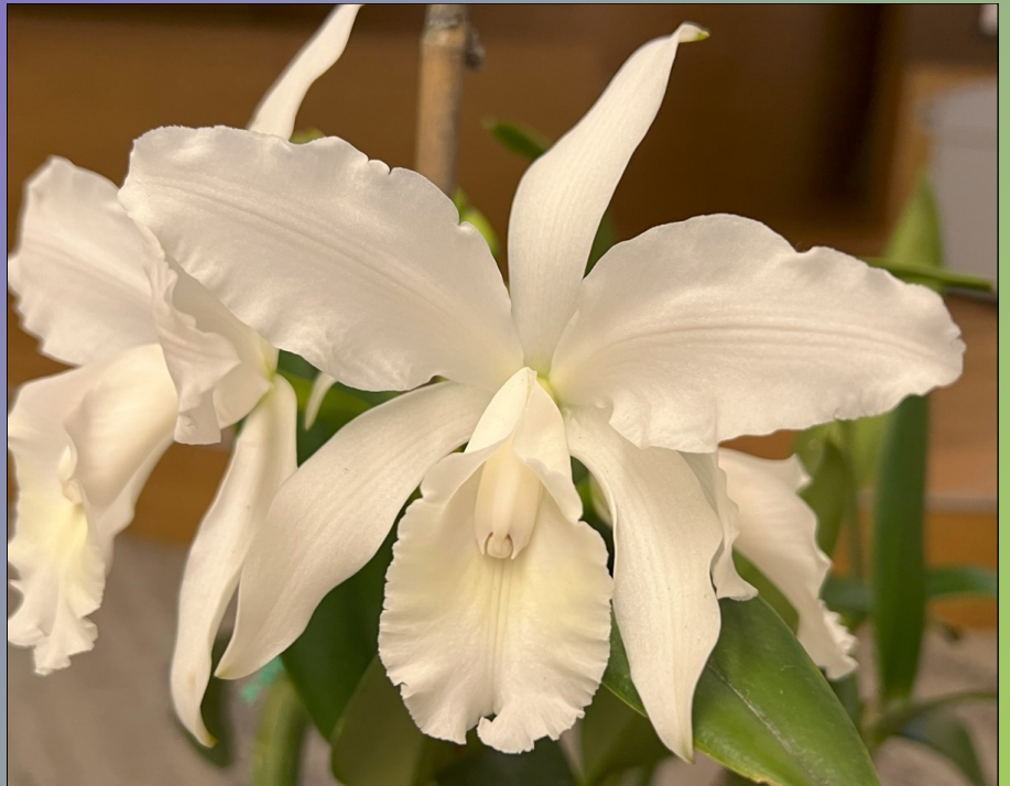
NHOS display at the San Diego County Orchid Society International Spring Show and Sale, April 2023.